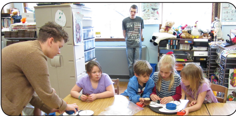
CROP students in Andes experimenting different sizes of belts and pulleys to transfer mechanical power.

If you are interested in learning more about any of HMM's educational offerings, please visit our website or contact Brendan Pronteau at brendanp@hanfordmills.org .