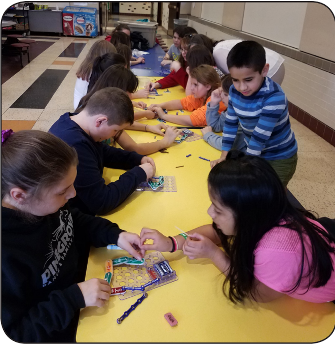
CROP students at Hunter-Tannersville learn about how circuits transfer electricity.

The HMM education staff was thrilled to learn that the region's Creating Rural Opportunities Partnership (CROP) grant application has been funded. Through the CROP program, Hanford Mills and other program partners have been serving ten schools in the region for the past four years, resulting in over 8,000 student interactions. HMM's educators are excited to continue their work with the CROP students.