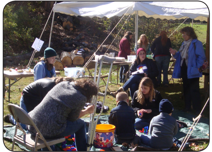
Cooperstown Graduate Program students worked with young visitors and tested activities at Woodsmen's Festival in 2016 as part of their work on the Learning Lab.

Join us Saturday, June 17, for the grand opening. Members are invited to our spring reception and Learning Lab preview on the evening of June 16.