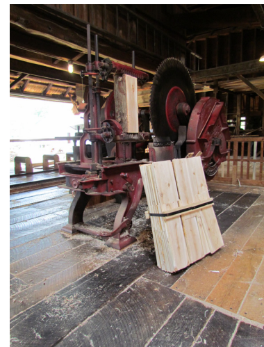
HMM is producing shingles this season for the Catskills Interpretive Center.

Upcoming events include the Independence Day Celebration, Free Family Saturdays, as well as workshops. You can connect with us on Facebook, Instagram and Twitter. We look forward to seeing you at the Mill, and as always, thank you for your commitment to Hanford Mills Museum!