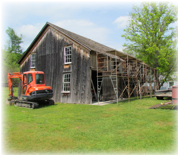
The Lumber Drying Shed is ready for its roof replacement.

There's always room for improvement and sometimes the improvements we make at Hanford Mills Museum are not easy to see. This spring we are improving the energy efficiency of the Walter Smith Hardware Store (now the Post Office building) and the Monroe House as we prepare to install a bulk feed wood pellet boiler that will heat both buildings. Most of the purchase and installation of the pellet boiler will be funded by a New York State Energy Research and Development Authority (NYSERDA) pilot program working to improve the capacity for the distribution of locally-produced bulk wood pellets