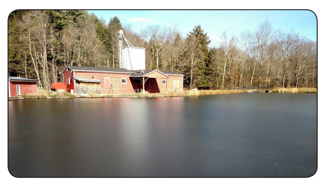
The mill pond's first thin coat of ice.