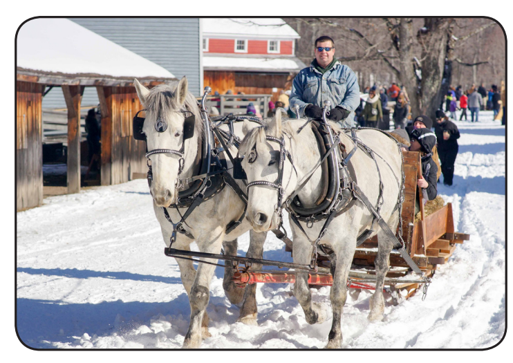
Horse-drawn sleigh rides are an annual favorite Ice Harvest activity.

Visitors are the engine that powers this event, and we're working hard to make sure that everyone who comes to the festival has an unforgettable experience. Whether you're cutting ice, taking a horse-drawn sleigh ride or enjoying our soup buffet, our dedicated volunteers and staff will be there to help enhance your visit.