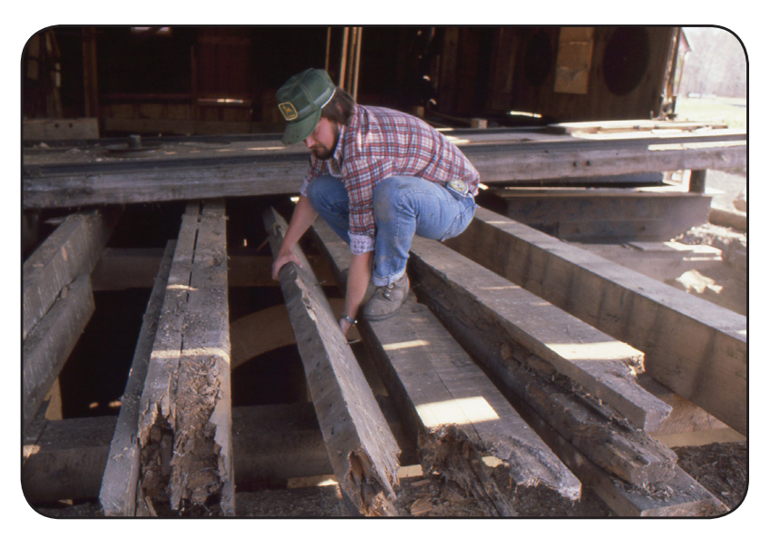
Rotted beams were removed and replaced on the Mill's main floor during restoration work in 1982.

Moving forward, HMM will continue to prioritize the site's stewardship—of the Mill, water system, and other buildings—as part of its three-year strategic plan that looks ahead at 2018–2020. The Museum will highlight some of the Museum's restoration and preservation projects as part of its new exhibit that will open in the summer of 2018. Watch for more details as we make plans to celebrate this 45th museum season.