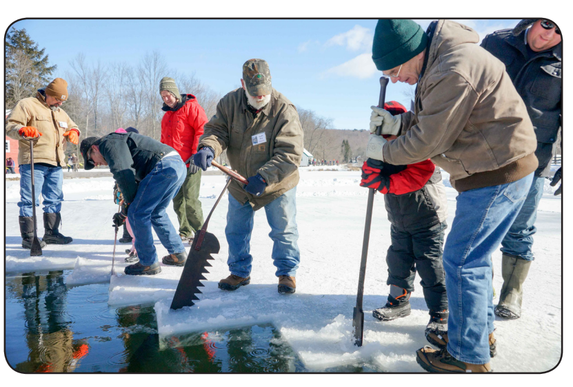
Visitors, staff and volunteers cutting and breaking ice blocks off the pond at the 2017 Ice Harvest.

An annual favorite of visitors from across the northeast, the Ice Harvest has grown in past years. It routinely attracts over 1,000 visitors to our humble historic site, and last year's festival shattered all previous records with over 1,600 people attending the event. With this surge in attendance, the staff has been working hard to make sure that our site can meet